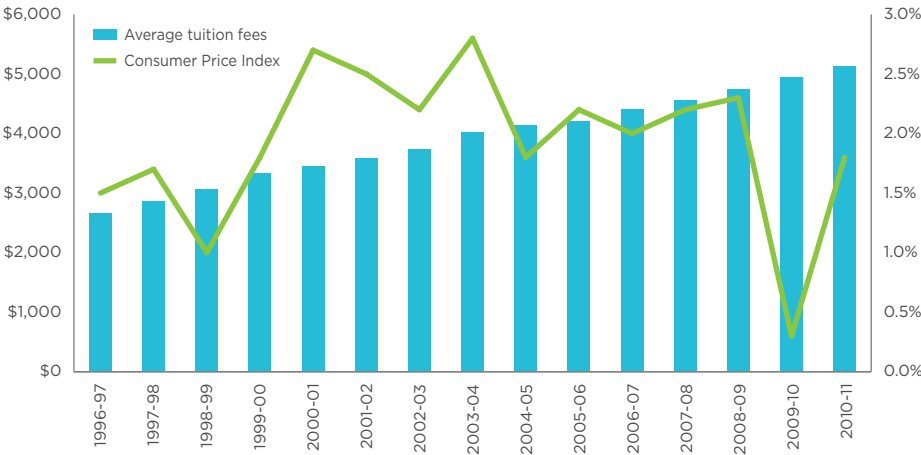
The rising cost of education

Ensuring that your child has access to a quality post-secondary education is an important decision. However, with the steady rise in the cost of education, sending your child to a post-secondary institution will be expensive. With a Registered Education Savings Plan, you have the comfort of knowing that you are providing a foundation for your child's future.